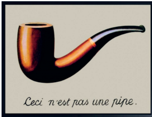
Figure 7: Margritte's painting of a pipe.

the essence of living systems, such as in the humanities. Interventions can have major consequences for a system (Engeström, 1987). It is therefore important to know in which system you are intervening. You have to zoom in and out in order to oversee the whole. Understanding complex reality goes beyond knowing and understanding stand-alone entities, by interpreting the relationships, the connectedness of the different entities, and their reciprocal dependencies. Thinking in relationships enriches the paradigm of giving meaning, naming, and describing entities (Libbrecht, 1995). In terms of Bateson, (1987; Montuori & Mountuori, 2005) creating meaning is the basis of the difference between entities that makes the difference and corresponding actions that lead, for example, to transition. Relationships, especially in the humanities, can have a qualitative value, and intuition and imagination as a way of thinking and learning (Ruiters, 2011) come to play a role in interpreting them. In the drive to understand, questions arise regarding what 'is', what the connection means, and what makes up reality in all its complexity?