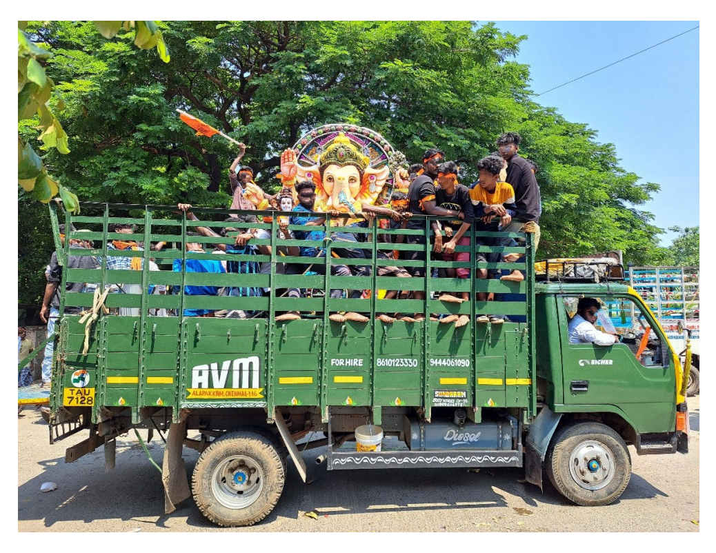
Figure 4. Young men with a Hindu Munnani flag and a Plaster of Paris Ganesha on a cargo truck at Valluvar Kottam on the day of visarjan (immersion) of Ganesha in Chennai. Picture taken by author, 4 September 2022, Chennai.

In 2022 the ten-day festival of Ganesha Chaturthi started on 31 August. Large Ganeshas were installed at multiple streetcorners in the cities some days prior to the start of the festival. I noticed in Chennai that these were frequently installed next to or in the close proximity of a Hindu temple. Some of these Ganeshas were constructed over a longer time period at the site itself (I discuss examples of the special ones below) but in Chennai most of the Plaster of Paris Ganeshas were sponsored by the Tamil regionalist right wing nationalist organization the Hindu Munnani. These Plaster of Paris Ganeshas were mass-produced in the northern neighborhoods of Chennai: Kodungaiyur/Vyasarpadi (informal group conversation, 31 August 2022, CIT Nagar). I was told that the Hindu Munnani donated in 2022 15,000 Ganeshas throughout Tamil Nadu (informal conversation CIT Nagar, 30 August 2022). The donation of the Ganeshas by this right wing Tamil Nadu nationalist organization, is obviously visible in the public sphere because they also hung their party flags around the temples and donated flags to people who joined the procession (see Figure 4).