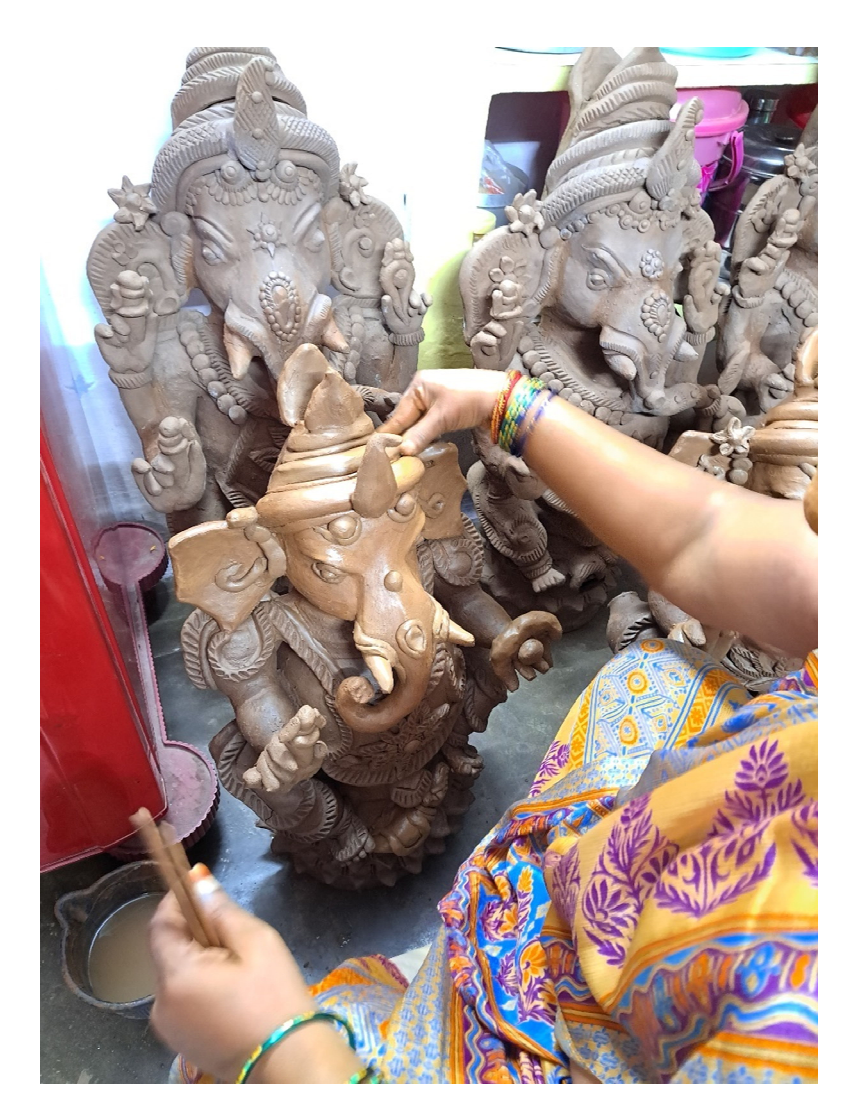
Figure 10. Hand manufacturing of clay Ganesha by pottery family in Vellore.

On the evening prior to the first day of Ganesha Chaturthi, I had the opportunity to create my own Ganesha of clay at the 'Green Ganesha: An eco friendly clay Ganesha making event'. This event was organised by and for students of the Indian Institute of Technology Madras. It was the first time that they organised this event and there was hardly enough clay to provide all approximately 60 students with the opportunity to mold their own Ganesha. For most students it was the first time to make their own Ganesha and they told me that—with some exceptions—they never made a Ganesha at home. Again, I was told that this is the traditional way of making Ganeshas for the festival of Ganesha Chaturthi. The Ganeshas that we produced during the eco friendly clay Ganesha making event were kept overnight and immersed the day after. I also was told to place a seed in my Ganesha. This brings me to the second category of Ganeshas: the seed-inside clay Ganeshas.