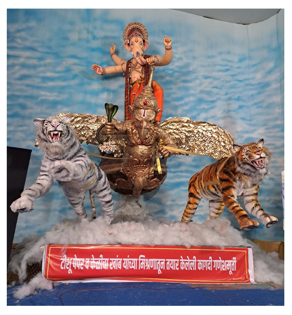
Figure 7. Tissue Ganesha in Vile Parle. 9 September 2022, Mumbai.

The second Ganesha to be discussed here is referred to as Girgaon cha Maharaja and located in Girgaon (South Mumbai, there are two more of these type of Ganeshas in the area). It is made of shadu chi mati , a type of pottery clay (see Figure 8). On the