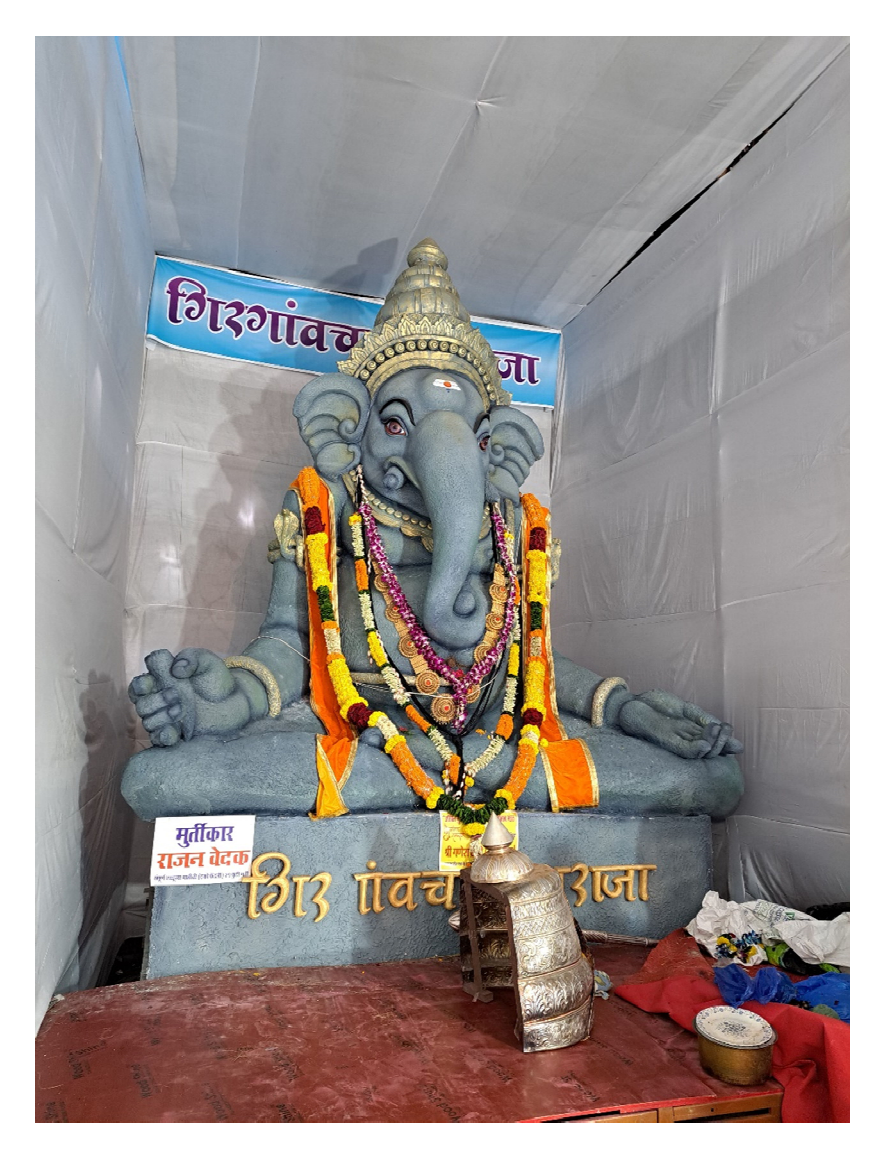
Figure 8. Girgaon cha maharaja Ganesha made of shadu chi mati (type of clay). Picture taken by author, 9 September 2022, Mumbai.

day of visarjan this Ganesha of 6000 kilos was taken in procession on a trolley (on which it has been constructed) to an artificial pond. They construct Ganeshas at Girgaon for 91 years and over the years the size increased. The construction of the Ganesha in 2022 was done by a group of five people over 15 or 20 days. It was modelled after a Ganesha from Indonesia. At Girgaon, they make every year a Ganesha that is modelled after a famous international Ganesha. One volunteer explained that they started to make ecofriendly Ganeshas because of the governmental regulations and using clay is part of the Hindu culture (sanskritiya). Also, they continue to make these type of Ganeshas to attract people (informal conversation volunteer Girgaon cha Maharaja, 9 September 2022, Girgaon). That both the types of ecofriendly Ganeshas in Mumbai have a strong aesthetical component becomes clear when we look at the rituals performed in these pandals during the festival time. At both places a smaller Ganesha was placed on the left corner of the stage. It is to these Ganeshas that people conducted their rituals. The large Ganeshas are not used in the puja: they have—except for the procession and the visarjan—lost their ritual functions and are to a large extent turned into eye-catchers (observation, 9 September 2022, Girgaon; observation, 8 September 2022, Vile Parle).