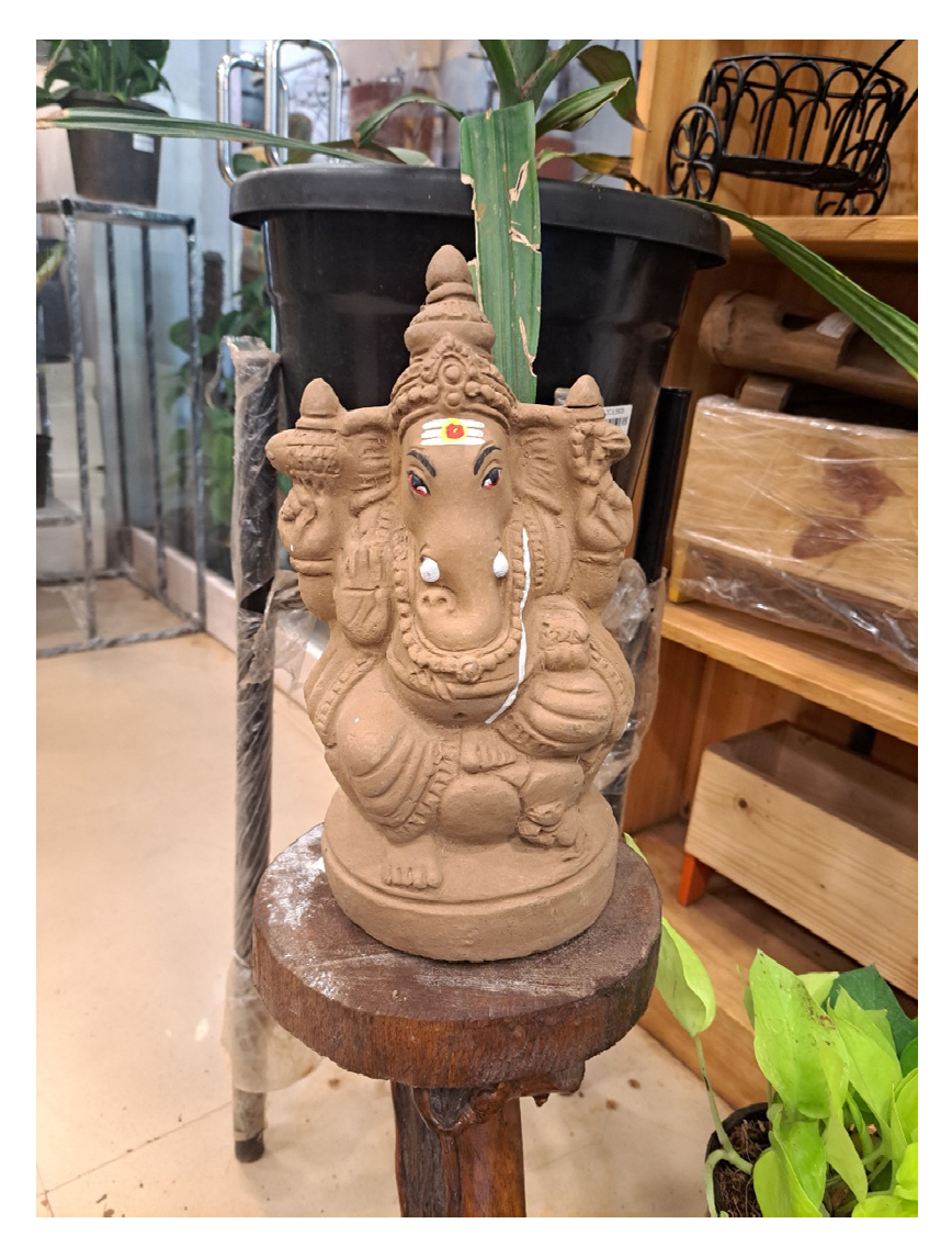
Figure 11. Seed-inside clay Ganesha sold at Harith Tharang, a plant nursery in T Nagar. Picture taken by author, 2 September 2022, Chennai.

different types of seeds are conserved: coriander, lady finger, spinach, lemon grass and chilly. The buyers of a seed-inside clay Ganesha receive proper instructions of how to grow a plant out of Ganesha: at Harith Tharang they sell it together with potting soil and flowerpots. Customers are told how to water it. Asking about their motivations to sell these seed-inside Ganeshas, the assistant manager explained that they mainly make these Ganeshas to create an awareness of greenery (interview with assistant manager Harith Tharang, 2 September 2022, Chennai).