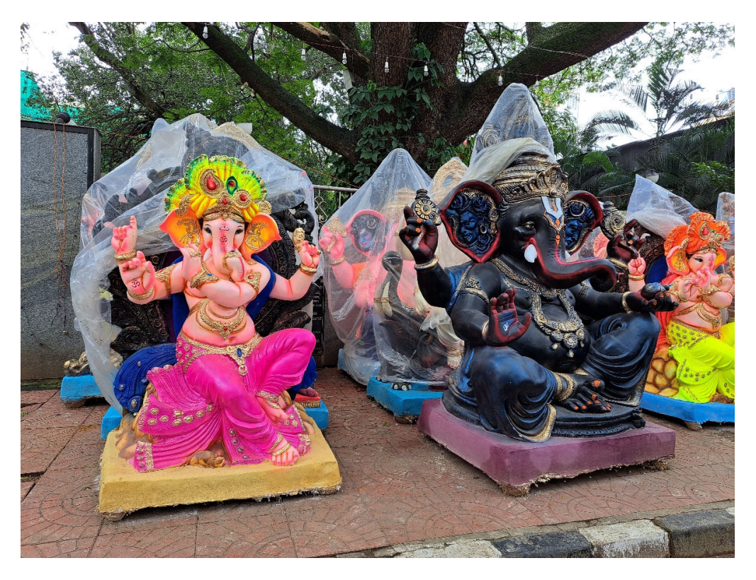
Figure 2. Large Ganeshas for sale in the week prior to Ganesha Chaturthi. Picture taken by author, 25 August 2022, Bangalore.

At present, large festival Ganeshas are produced well before the start of Ganesha Chaturthi and some days prior to the festival placed in pandals (temporary structures, stages, see for examples of large Ganeshas Figure 2). The festival Ganeshas are ritually consecrated ( pran pratishtha ) by a priest (Fieldhouse 2017, p. 233). At the end of the festival, the Ganeshas are taken in procession to a waterbody where they are immersed ( visarjan ) into the water. This immersion into the water also happens with small (clay) Ganeshas that are placed during the festival time in home shrines. Joyce Flueckiger explains how in Hyderabad a matriarch of the family created a Ganesha out of clay and dropped it in a water well in the garden on the third day. Other people bring their Ganeshas to the Ganesha pandal in the neighborhoods from where the Ganeshas are taken together with the large public Ganesha in procession to the waterbody at the end of the festival (Flueckiger 2015, pp. 130–31).