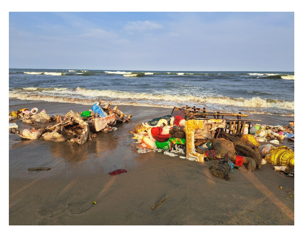
Figure 1. Washed-up Ganeshas at Pattinapakkam beach in Chennai on the day that the visarjan (immersion) of Ganesha took place in 2022. Picture taken by author, 4 September 2022, Chennai.

The assumption that the well-known practice in Hinduism of reverence of natural phenomena—referred to as bio-divinity by Emma Tomalin (Tomalin 2009)—results in environmental friendly behavior, can easily be objected: ritual practices devoted to for instance the sacred river Yamuna cause severe pollution to the river (Habermann 2017, p. 38). Inspired by a global awareness of climate change, Hindu rituals at riverbanks and seashores have been scrutinized in popular media by environmentalists and by researchers. The ritual practice of visarjan or immersion (of idols) is one of the most polluting ritual activities (see Figure 1). Visarjan is, amongst other Hindu minor festivals and rituals, specifically known as part of the annual festivals of Ganesha Chaturthi and Navratri. For the latter, the festival statues of Durga are immersed at the end of the (ten-day) festival at public waterbodies. Studies have been conducted on the effect of the water quality and the increase of heavy metals due to the immersion of Durgas (Zaman et al. 2018; Makwana 2020). A brief exploration and my fieldwork (in Mumbai, where Navratri is also extensively celebrated) suggests that the efforts to make ecofriendly Durgas is limited compared to the increase of Green Ganeshas (interview Prasanth 8 September 2022, Mumbai). The adaptability of Ganesha is discussed in more detail in Sections 3 and 6.