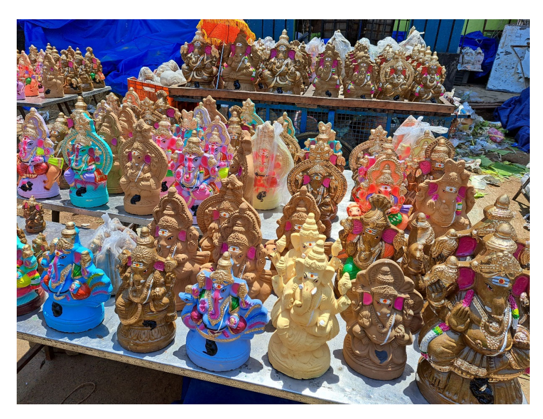
Figure 9. Street vendors sell mass-produced clay (mixed) Ganeshas. 30 August 2022, Chennai.

around 100 rupees (a bit more than 1 euro; informal conversation street vendor, 31 August 2022, Chennai). The production costs of these mass-produced clay Ganeshas are very low. For most of the street vendors there were no underlying motives of environmental sustainability behind their businesses. I now discuss several alternatives of small Ganeshas that are explicitly marked as ecofriendly, or sustainable to answer the question of what kinds of ecofriendly Ganeshas are used during the festival of Ganesha Chaturthi and how the festival is employed to create an awareness of environmental sustainability.