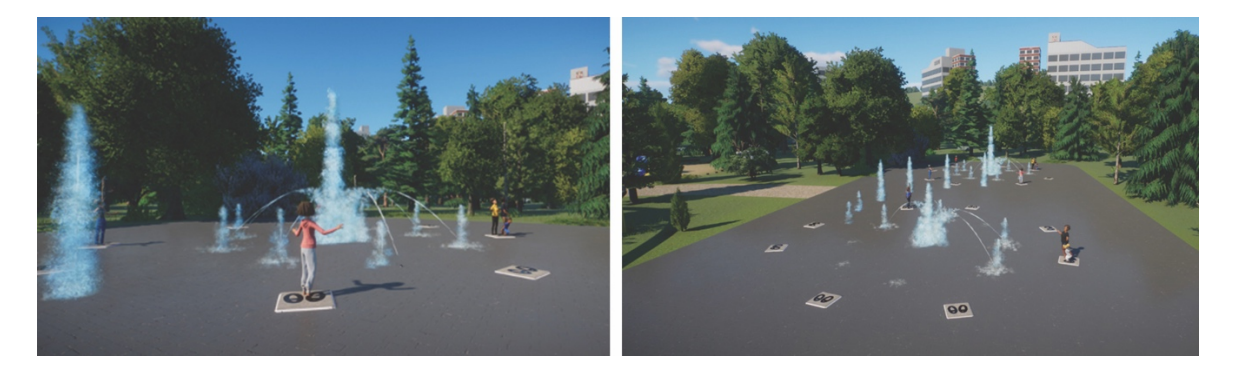
Figure 2: Fontana concept impression - render created in Planet Zoo (Frontier Developments 2019)

CHI '22 Extended Abstracts, April 29-May 05, 2022, New Orleans, LA, USA