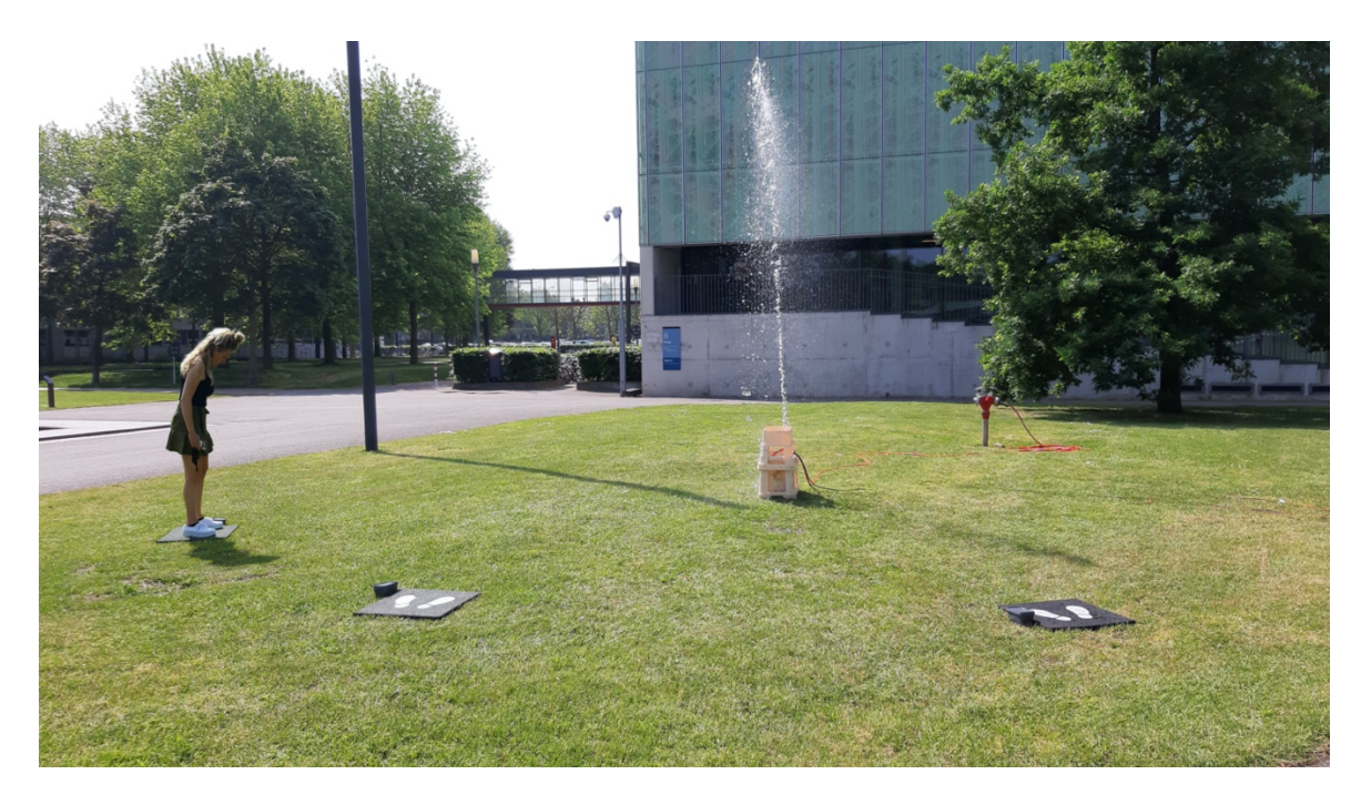
Figure 4: Pilot test setup: full prototype

CHI '22 Extended Abstracts, April 29-May 05, 2022, New Orleans, LA, USA