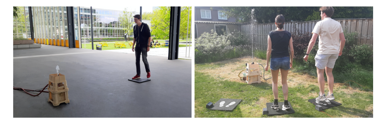
Figure 3: Pilot test setup: a) first iteration WoO setup; b) synchronized interaction with second iteration prototype

different users by including several interaction modalities. The pads respond to jumping and stepping as well as strolling over or tapping on them. The pads are clearly recognizable through their color, circular shape and waved texture. Additionally, accessibility is optimized by keeping the installation level with the surrounding area.