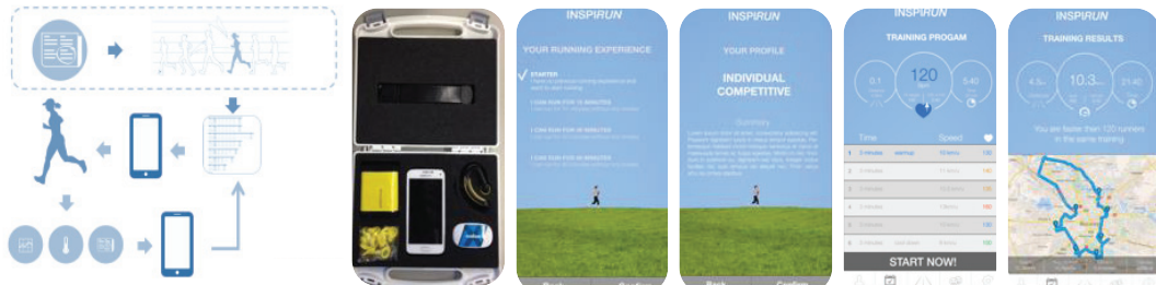
Fig. 2. The Inspirun personalized running coach

Inspirun is built with the Ionic Framework, and therefore is essentially a browser application, making heavy use of JavaScript and AngularJS. In addition, D3 is used for rendering vector graphics. A training session (see above) is the main ingredient for the Inspirun application. It bundles a considerable amount of sub-components together in order to provide an easy and intuitive interface to the entire training functionality of the application. A training session can only be started when there is an active GPS signal and connection to the Bluetooth heart rate monitor (see Figure 2).