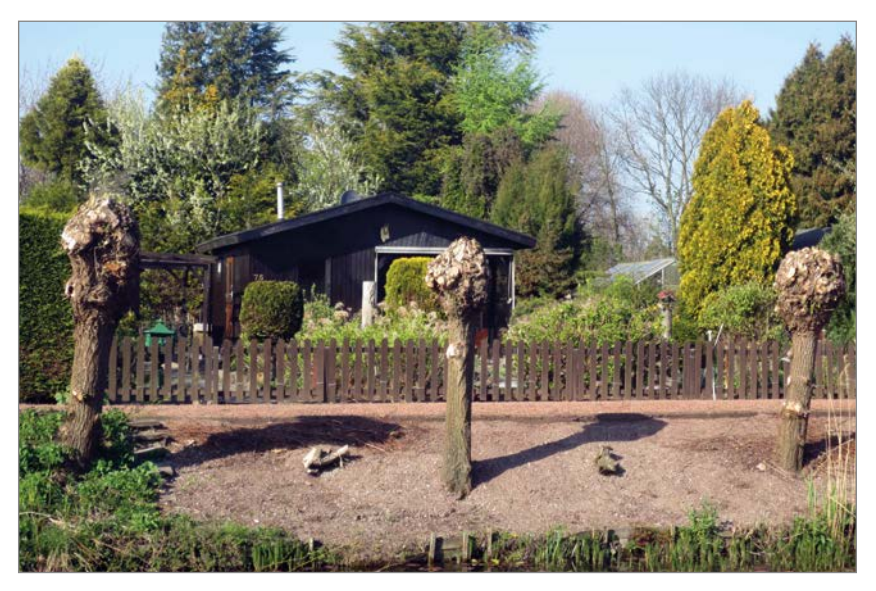
Figure 3. 'Tidied trees' near Amsterdam, the Netherlands.

Without wild experiences, we risk our children moving even further into the