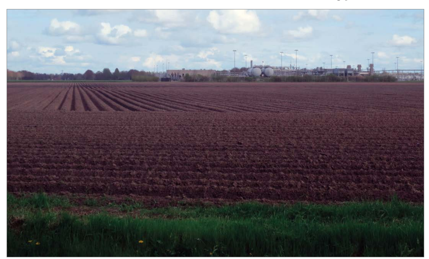
Figure 2. Intensive agriculture in Groningen, the Netherlands.

Yet unsustainable and unethical treatment of the land not only tends to go unnoticed by the public but is also largely invisible in the academy. Instrumentalism, bolstered by constructivism, has led to an overt critique of 'wilderness' and 'nature' as idealizations or mere 'social constructions'. This is illustrated in an extreme way by the Ecomodernist Manifesto (Asafu-Adjaye et al., 2015), which sees nature as a means of reaching prosperity. The Manifesto envisions a bright future of "vastly improved material well-being, public health, resource