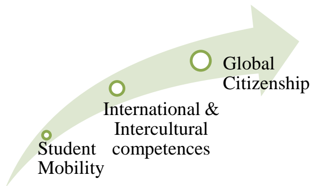
Graph 1I. Conceptual Framework of the importance of student mobility for European Studies