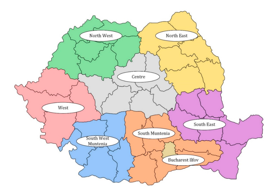
Figure 3. Map of Romania and its Development Regions.

percentage of older people has risen from 10.9% in 1992 to 16.5% in 2019 (for people over 85 years from 0.6 to 1.8%, Tables 3 and 4). This increase is mainly due to urbanisation, and the availability of better healthcare services.