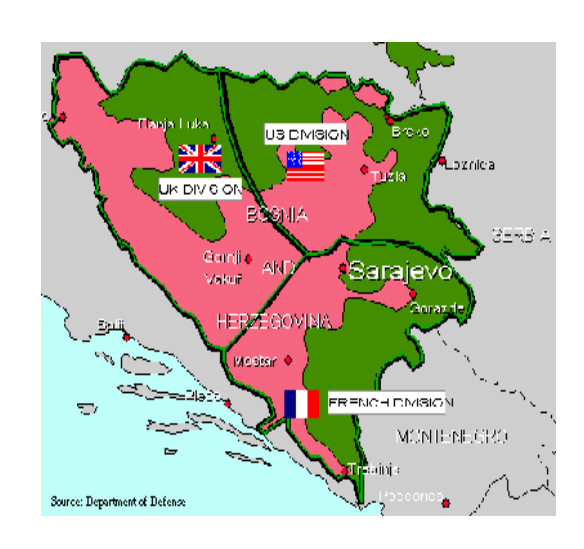
The map shows the two entities, the Federation (light) and RS (dark). Furthermore, one can see the distribution of the international IFOR/SFOR troops and their countries of origin, resembling very much to the division of the city of Berlin by the allies after WW II

The Dayton Accords (DA) did not only change BiH's complete political structure as set in the Annex 4 but also contributed to a transformation of name from 'The Republic of Bosnia and Herzegovina' to simply Bosnia and Herzegovina. Furthermore, a system of governance was elaborated, giving a foreign 'High Representative' the highest decision-making authority. This Representative obtained the authority to implement laws and to remove and replace elected officials. He received an observer as well as an actor role, assuring the implementation of the DA. The International Community hoped to prevent a new escalation of the conflict by creating this position.