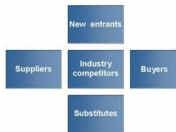
Figure 4.4: Porters' Five Forces Model

Using the Five forces of Porter model is useful to help the company understand both the strength of the current competitive situation of Delicatezze d'Italia, and the strength of the position where Delicatezze d'Italia is considering moving into.