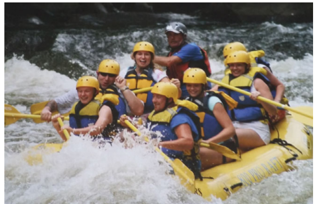
PICTURE 2 Fighting the battle, with the NP in the lead [Color figure can be viewed at wileyonlinelibrary.com ]

the matter.... Yes, a nice talk with the NP and you heard again that it was going well. Yes.... that I was always able to tell her my story." (ID05)