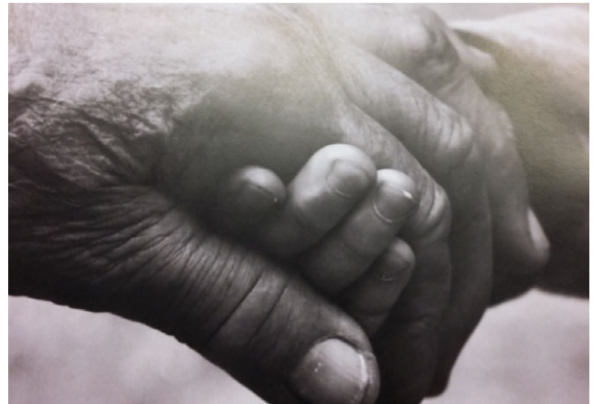
PICTURE 1 Feeling safe, doing it together [Color figure can be viewed at wileyonlinelibrary.com ]

Other, less frequently used, metaphorical expressions were lifebuoy sign and tower of strength . One participant who came up with the latter metaphor described it this way: "I don't have.... no parents anymore. Yes, is logical somehow at this age. Siblings. Yes. Also friends and acquaintances I can talk to. But on the disease level or my body and everything, there she has.... There you talk with... I can talk about it well with her. How I feel. The family situation.... Or whatever else has been a lot of misery. Yes, those kinds of things.... If something was