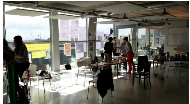
Figure 2. Event space with participants of Gov Jam 2014.

focus on human needs. The hackday started at 10 AM and ended at 7 PM with pitching the prototypes to a jury of experts. A Fitbit was granted as first prize to the winning team, and gift coupons as second and third prize.