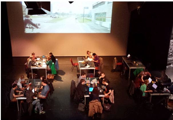
Figure 2. Hall with participants of Hackday Data of the Crowds 2014.

For the hackday, April 9 th 2014, we as university invited design companies to which the university was already related for curriculum purposes, internships and as advisory board. In the end 17 participants from 4 companies were involved in the hackday. Public servants were not involved as active participants but three public bodies of the city of Rotterdam brought in a dataset to be used by participants. Students and lecturers of the university were internally invited to join. 14 students took up the challenge. The event was announce through a website, Twitter account and a Facebook-page, through which 2 citizens signed up for the event. See also table 3 for an overview of the participants per helix.