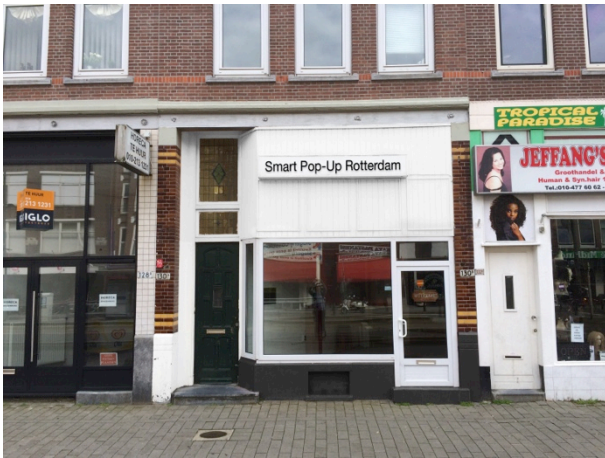
Figure 4. The Smart Pop-up lab in a local shopping street.

PARTICIPATORY PROTOTYPING LAB SMART POPUP During one school semester, September 2014 – February 2015, we established a lab, Smart PopUp, in a neighbourhood in the city of Rotterdam, for 10 4 th -year bachelor students who signed up for a minor course.