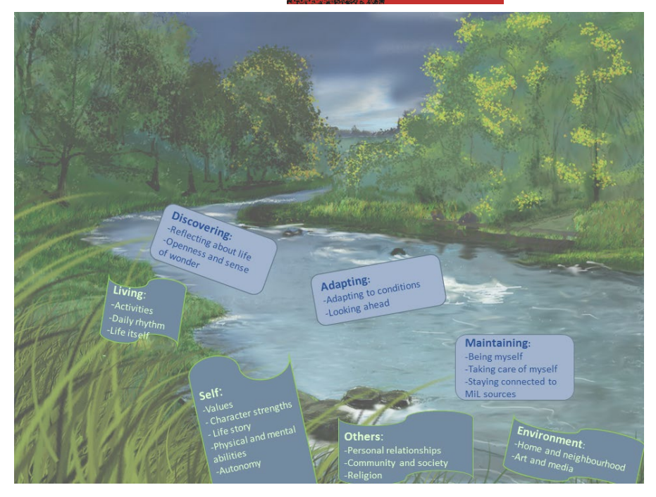
FIGURE 3 The river of meaning in life for community-dwelling aged persons who receive homecare