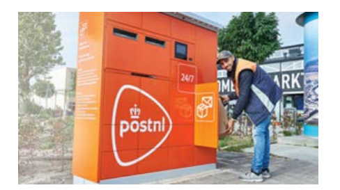
Fig. 2. Example of a Parcel locker

As can be seen in Table 2 the only thing that differs is the height of the lockers; the width and length are exactly the same. The current overall dimensions of the complete parcel locker are, 1610mm x 525mm x 1758mm. The parcel machine has a touchscreen and can be used to draw signatures. A camera is mounted in the locker as well for safety reasons and the machine is reasonably vandal proof. Consumers will receive an email/text when the parcel has arrived in the locker. The machine has a scanner as well, to be able to scan ID's when needed. The maximum storage in this machine is 3 days, where after the parcel will be transported to a nearby retail location.