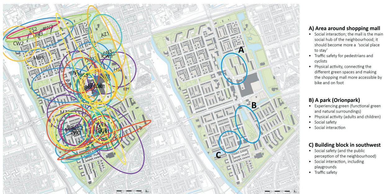
Figure 5. locations selected by the various assessors – each assessor indicated with initials and a colour shared with one other team member (left); priority-location and topics per location are listed on the right.

The ultimate selection first regarded two park-regions but then the decisive criterion was that in one already some changes had been planned. Figure 5 shows the selected locations per assessor on the left, and the three prioritised locations and topics per location on the right side of the image.