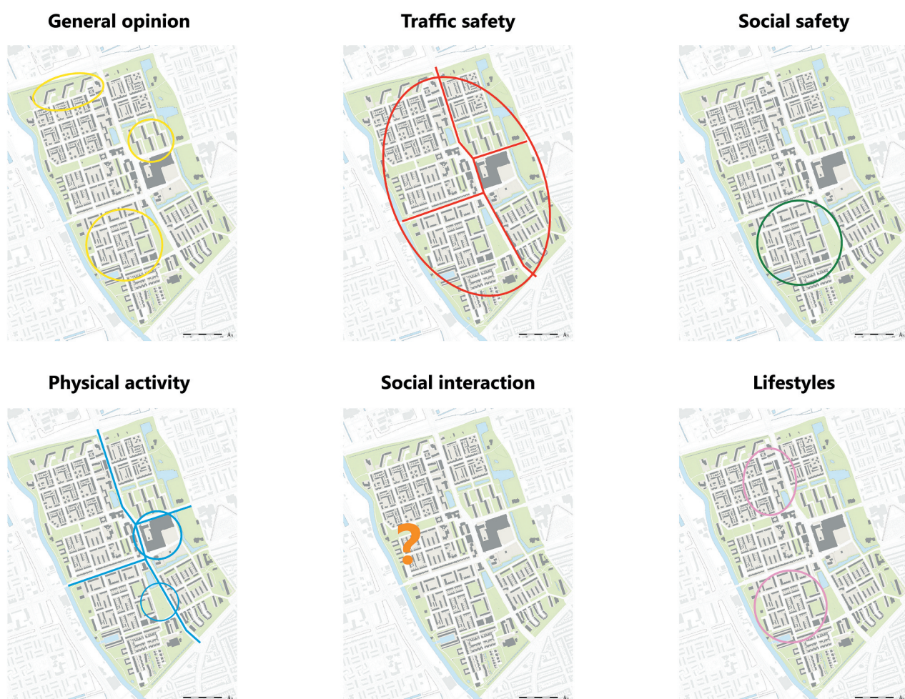
Figure 3. Core challenges in the Paddepoel neighbourhood according to the opinions of experts in public, health and social care, regarding six topics; circles indicate areas of particular concern, lines indicate roads deserving particular attention, and the question mark indicates a general lack of appropriate sites.

data from each of the three sources was presented at its start. Next, we used Miro software ( www.miro.com ) in both sessions to support the process. Sessions were chaired by the first author and minuted by the second author who also safeguarded all online Miro-outputs.