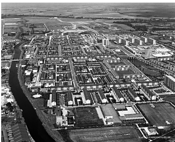
Figure 1. Aerial photograph of the neighbourhood in the early 1950's, shortly after its inception (reproduced with permission of the copy right holder, Aerophoto Eelde).

Groningen is with 230,000 inhabitants the fifth largest city of the Netherlands, and with almost 60,000 students a typical, historical college town in the north of the country. It has relatively large socioeconomic differences within the city. Specifically, we focused on the neighbourhood of Paddepoel, a post-war neighbourhood encompassing 11,000 residents. It is characterised by a number of spatial, demographic and socioeconomic challenges that are representative for this type of ‘post-war reconstruction’ neighbourhoods, as outlined in the introduction. These challenges in particular regard a focus on car mobility, large roads cutting the neighbourhood in quadrants with repeating housing blocks, one central shopping mall and relatively abundant but mostly inaccessible and unprogrammed green. Figure 1 shows a picture of the neighbourhood shortly after its building, with a building pattern of stamps and strips typical for post-war neighbourhoods.