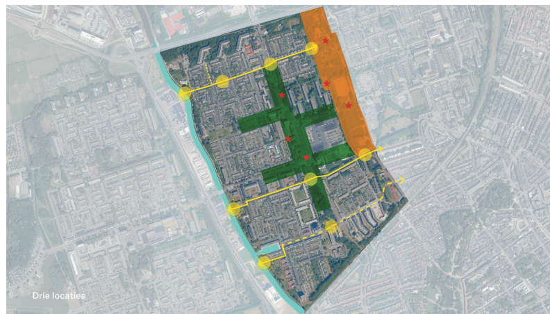
Figure 2. Core challenges in a spatial analysis of the Paddepoel neighbourhood: providing better East-West connections (yellow), reduction of car traffic and connecting fragmented green areas (green), and upgrading underused public spaces (brown); red stars indicate locations rated a highly promising for redesign by the urban designers.