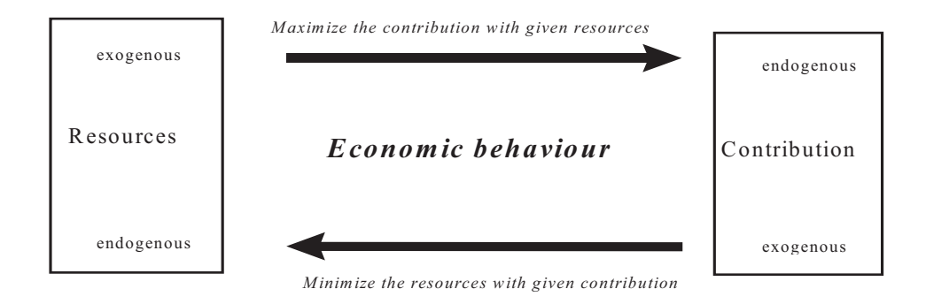
Figure 1: Economic behaviour

(costs) and the rendered contribution (benefits) forms the basis for optimizing management control in terms of output. The returns of the guilders spent, on the one hand, and the costs of