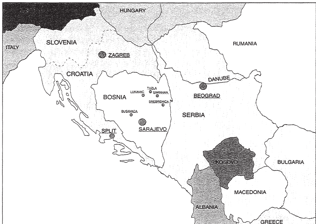
Figure 1: The former Yugoslavia