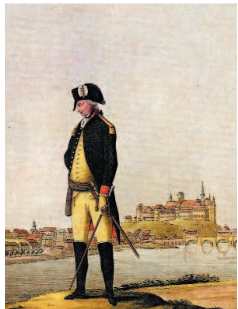
Saxonian cadet early 19th century