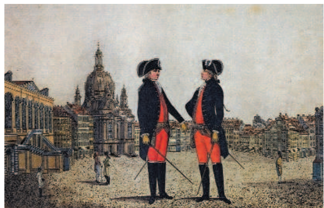
Saxonian cadets early 19th century

In this period of time there were a few responsible officers who actively opposed the pushing back of the general education element in the officer education. These generally broadly educated officers did not strive for a scientification of the officer education, but rather the application of the latest scientific insights to the military profession, in order to keep up with the technological, political, social and economic changes in the state and society. Between 1840 and 1872 their most prominent representative was General Eduard von Peucker. (Bald, 1978: 21-28) It was also on his initiative that the new Prussian King Friedrich Wilhelm IV issued an order that made the civilian educational ideal an integral part of Prussian officer education. As a consequence of the Revolution of 1848, even, all military education centres were to be dissolved and the officer education to be transferred to the universities, in order to increase the level. These attempts, however, were rejected by the army on grounds of absence of any practical elements. Conservative circles, mostly comprising the landed gentry, vehemently opposed the civilian educational tendencies in the officer education, as they found