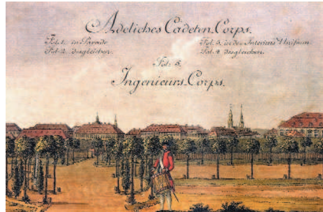
Saxonian cadets' school early 19th century