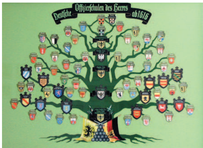
Genealogical table of the German officer schools 1616 - present