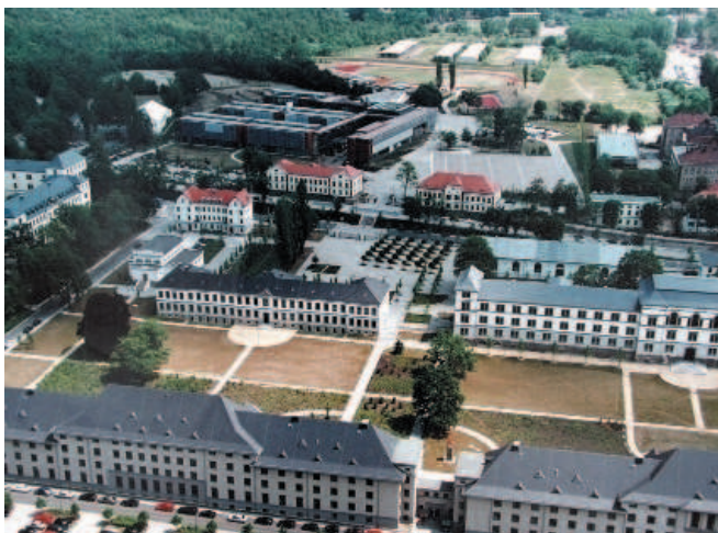
German Officersschool, Albertstadt, Dresden