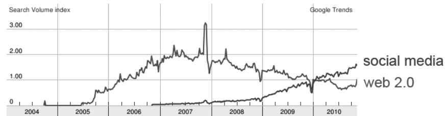
Figure 1. Google trends: “Web 2.0” against “Social Media”

social networks with personal profiles, as pointed out by Boyd and Ellison [51]. The media hype around the term Web 2.0 is decreasing. The trend is downhill. Today, people are talking about Social Media. The Google trend comparison in figure one illustrates this.