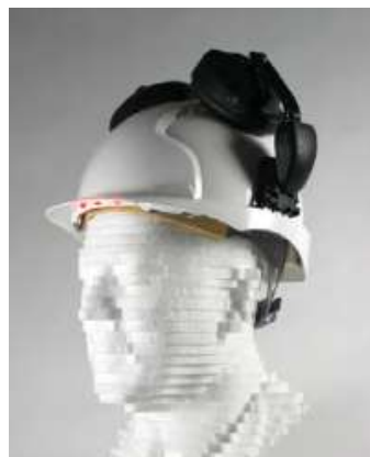
Signal for excessive sound & integrated ear protection