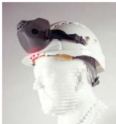
Light signal for excessive amount of dust & dust mask

In order to reflect these designs with construction site workers, three prototypes (see Figure 2) were built. In these prototypes all concepts were integrated. The functionalities in the prototypes were tested with a wizard of Oz method. 8 construction site workers participated in interviews during a workshop. They took part in a demo wearing the prototypes and reacted to work simulations. Interviews were planned to discuss the prototypes, and were conducted by the succeeding grad student.