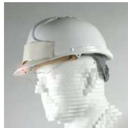
Machine lock (deactivated when wearing helmet), dangerous zone, and approaching vehicle detection