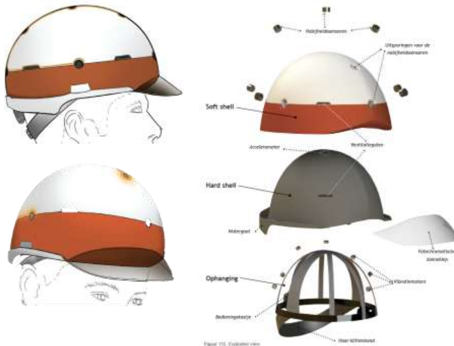
Figure 3. Integrated conceptual safety helmet

The results of this conducted usability study by Lemmens [10] showed that not all problems found by Wanders were equally relevant. Also, some issues were discovered that were not included in the earlier studies. E.g. Construction site workers tend to bump their heads more often when wearing safety helmets, because of a lack of sense. Most workers indicated that they wore their helmets because it increased their safety, and because it was expected of them. However, part of the workers did not show any intrinsic motivation for wearing the helmet. For example, 1) a helmet was demonstratively thrown onto the ground; 2) a helmet was broken and still not replaced for a new safe one; 3) sun vision protection was sown off, to create better sight. Construction site workers reacted positively on the concept of an integrated smart system. Lighting signals or warning sounds were seen as unusable as they could hardly be seen in daylight or heard on site. Based on the findings during the interviews a new integrated concept was designed (see Figure 3).