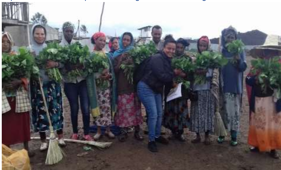
photo 2 When Informal production of vegetable divided among the members in Nifas Silk lafeto area / Wereda 5/