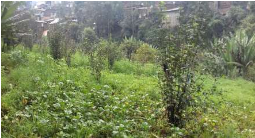
photo 4 UA area practice in Kolfe Keraniyo sub city

In the focus group discussion, the urban agriculturalist was asked if there is another income source they have other than urban agriculture. They mentioned that they engaged in different income generating activities such as casual labour, non-skilled jobs and they also get support from relatives.