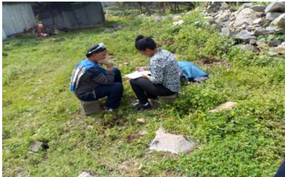
Photo 3. Interview on the FCS of the household of Nifas Silk lafeto sub-city (werda 2)

In the group discussion, the UPSNP beneficiary was asked if they are engaging in other income-generating activities other than participating in public work which is provided by the government. They mentioned that they have engaged in the different activities such casual labour, injera baking, cloth washing, and some were begging as a source of income.