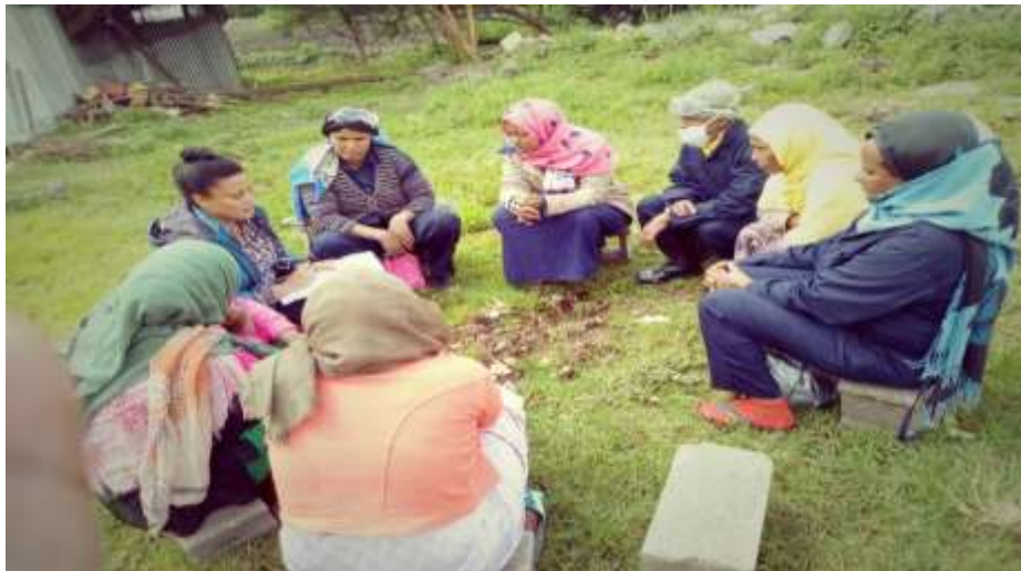
Photo 1. Focused Group Discussion with the beneficiary of UPSNP

The FCS is a proxy indicator to measure food consumption and is a choice of instrument for, amongst others, the World Food Programme and the Integrated Food Security Classification. The FCS collects info on the consumption of a number of food groups over a 7 day period including the main source of the foods consumed (e.g. local purchase, barter, own production). So, not only does the FCS provides a reading of food consumption but it also shows the diversity of food groups being consumed providing a measure of dietary diversity and nutrition.