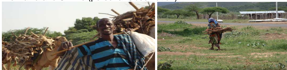
Photo 4.1 Man and Women carrying firewood

Sale of firewood and charcoal are the main income diversification activities for the pastoralist in the district. These are also the first and the main drought coping option for the pastoralists in which women are engaged in the sale of firewood while men sale charcoal. But for those PAs that are far away from cities both the firewood and charcoal are sold by men. In addition, the researcher observed men selling firewood in bulk at cities of Dire Dawa and Shinile using camels. However, women carry smaller quantity on their back and sell in nearby places. As a result men sell the firewood at much better price (40 to 60 birr per a camel load) as opposed to women who sell at 10 to 20 birr per back load (FGDs with women). Similarly, women do sell charcoal but mostly around their home unlike men who take to city using camel. Because of this women sell the charcoal at much lesser price (35-50 birr per sack) in the village than men who sell at 75-95 birr per sack at cities of Dire Dawa and Shinile (personal Observation).