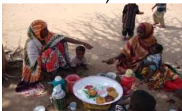
Photo 4.2 Women selling Biscuit an tea

I am 25, I came from Oromiya region by marrying a Somali man. In my place I used to sell fruits but here this is not common. Rather most women are engaged in sale of firewood. I also start selling firewood after I came here. Because most women sell firewood in drought times than normal situation, price of firewood decline and not enough to buy grains for our foods. In this time, in addition to firewood, I sell “enjera” “biscuits” and tea to those who come to our village for food aid, wait for car to Djibouti and Dire dawa. (interview with a women in Kalabadi PA).