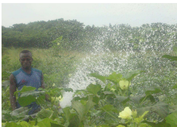
5. Local farmer irrigating his okra farm