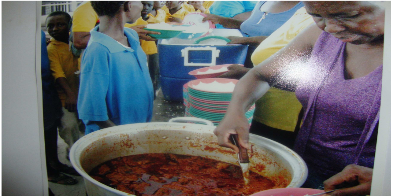
7. School children being served their meals in the Ga East Municipality