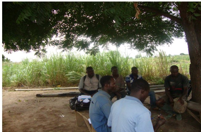
2. Focus group being interviewed