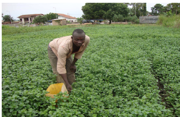
3. A Participant Local farmer in his 'Ayoyo farm' weeds