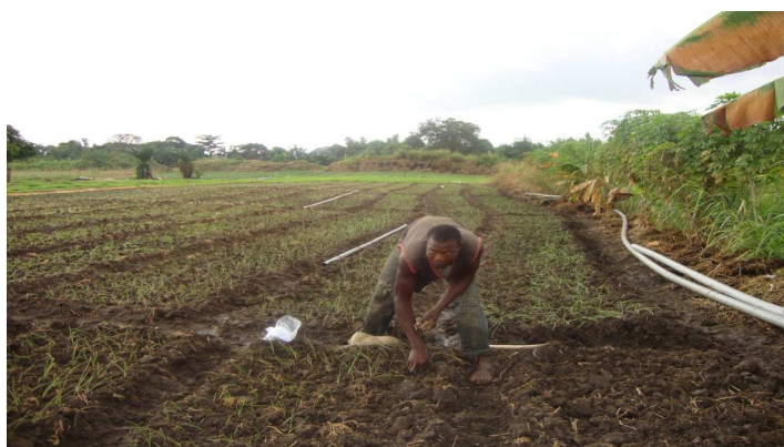
6. Local farmer transplanting Onions