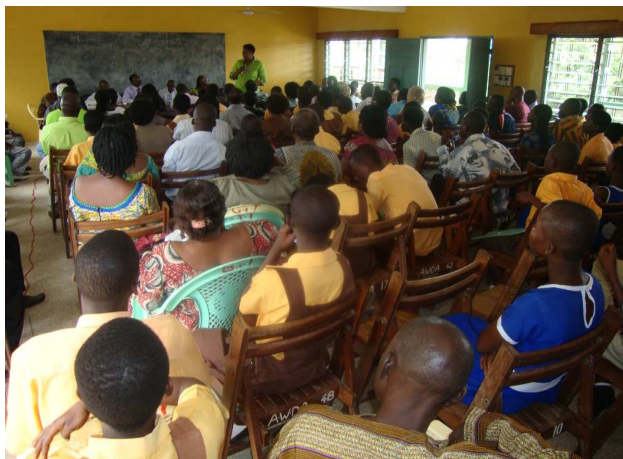
1. Inauguration of SICs in the Ga East Municipality