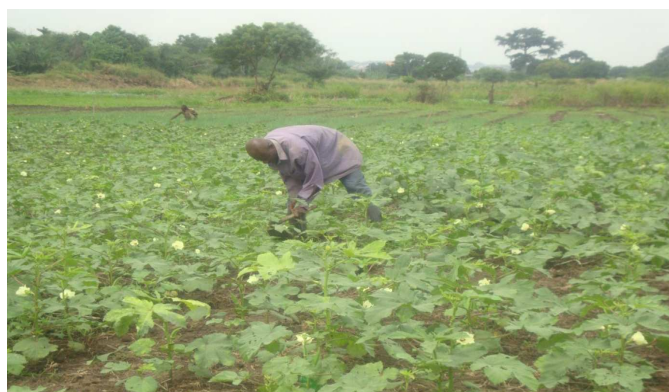
4. Local Okra farmer controlling