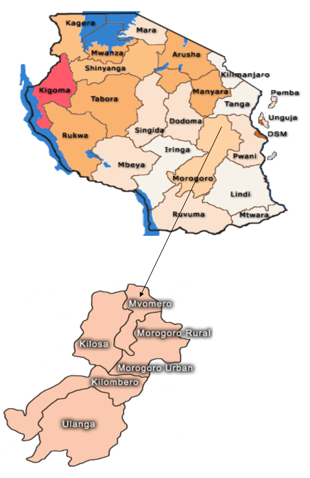
Figure 1: Maps of Tanzania and Morogoro Region showing Mvomero District