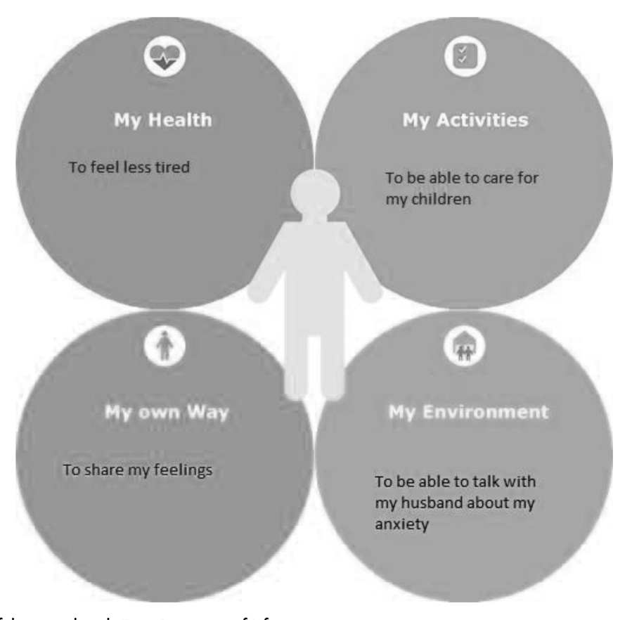
Figure ■ Example of the visual tool "Four Domains of Life."

Data collection occurred between June 2017 and March 2018. Participants were interviewed in the second and third week after the aftercare consultation via face-to-face narrative interviewing at the participants' home address. We developed an interview guide with open questions, as suggested in the narrative literature. The interview guide was used flexibly by following the participants' stories to create opportunities for extended narration. First, we invited patients to tell about their experiences of early aftercare in personal stories. Examples of questions asked were as follows: "How are you doing now?" "How did you