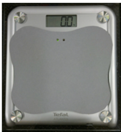
Figure 1. Modified bathroom scale.

measuring instrument [22]. The GARS consists of 18 items, 11 of which refer to activities of daily living (ADL) and seven of which refer to instrumental activities of daily living (IADL). A copy of the GARS is provided in Multimedia Appendix 1 . For each item, participants indicated on a 4-point scale whether they could perform the activity independently without any difficulty (score of 1), independently with some difficulty (score of 2), independently with great difficulty (score of 3), or whether they could not execute the activity independently (score of 4). So, if participants scored 4, they depended on other people for the performance of that activity. Overall disability, ADL disability, and IADL disability sum-scores were calculated and ranged from 18 to 72, 11 to 44, and 7 to 28, respectively—higher scores indicated higher disability levels. Disability development after 6 months of follow-up was operationalized as increased dependence in daily activities—ADL and IADL combined—meaning that a participant was dependent in at least one more activity of the GARS at follow-up compared to baseline. This was calculated by subtracting the number of activities in which a participant was dependent at baseline from the number of activities in which a participant was dependent at follow-up.